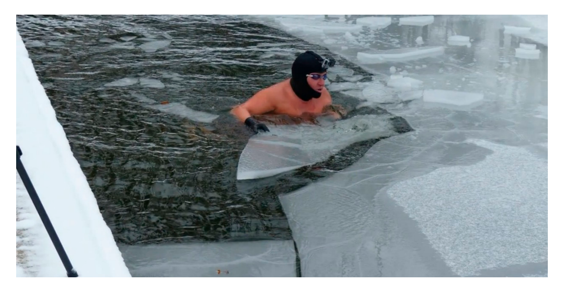
Figure 1. Ice swimmer in the preparation of his pool for training.